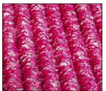
.40" (10 mm) Ultra Drain Mat

Ultra Drain Mat fabric side Ultra Drain Mat in Stucco Installation